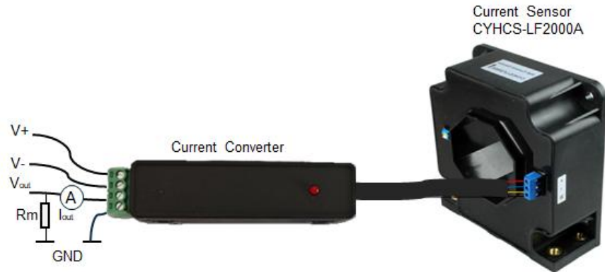
Fig.3 Connection between converter and sensor

Current sensor CYHCS-LF2000A will be used as an example.