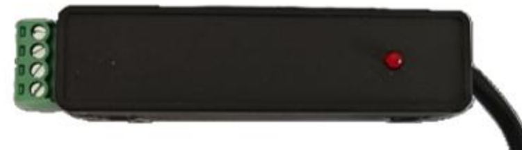
Fig.1 Converter Case